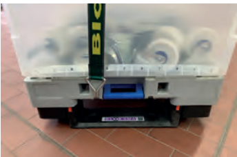
Matching hook for plastic pallets