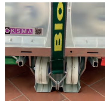
Matching hook for transport pallets