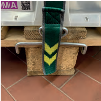
Matching hook for wooden pallets