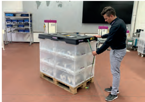
With integrated lashing strap